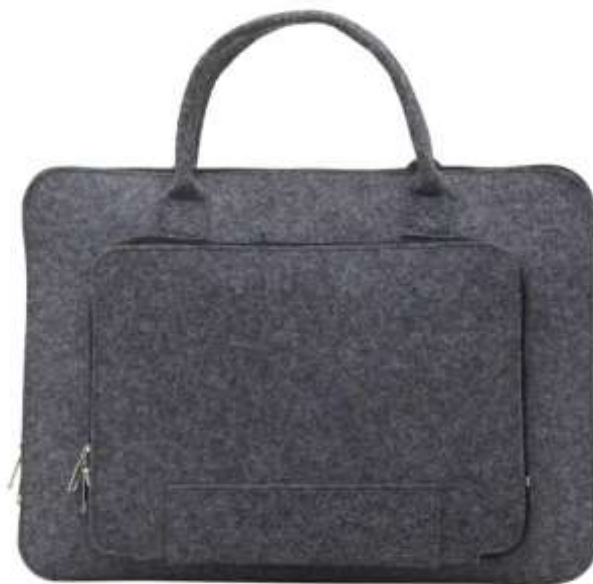
OLB 06 – B02