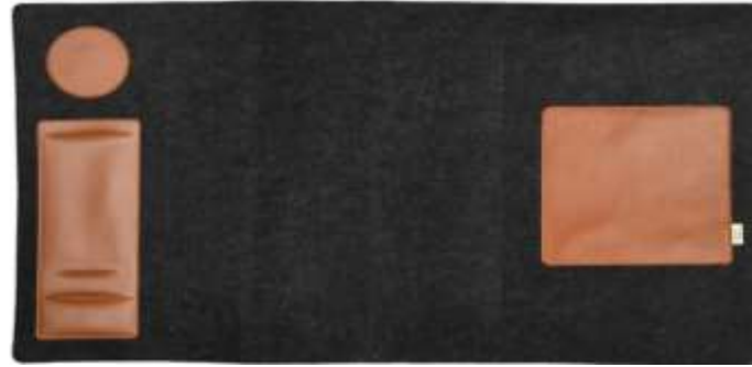
ODO 03- B-02