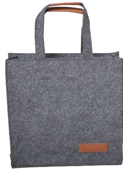
OCB 01 – Carry bag with Chain