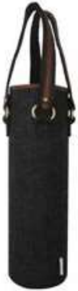
OBC 02 - Bbr