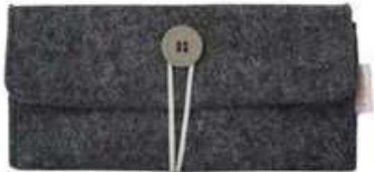
OEC 3A - DG