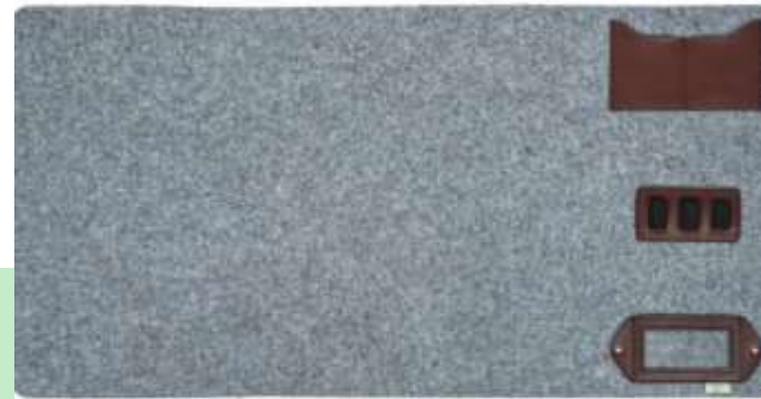
ODO 05- LG-04