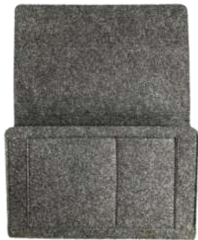
OFO 06- LG