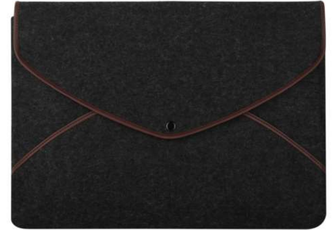
OLS 18 – B04