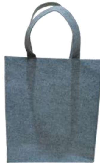
OCB 01 – Carry bag without Chain