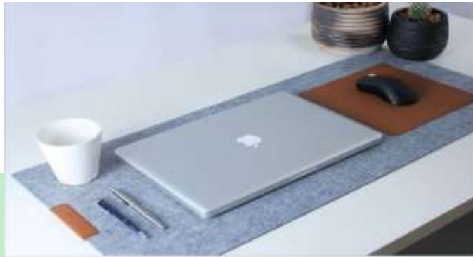
ODO 04 – LG-02