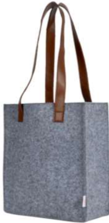
OBC 05 - LG02

The felt wine or water bottle holder is an elegant corporate gift choice that combines practicality and sophistication. Designed to securely hold a standard-sized bottle, it is crafted from premium felt fabric for a touch of luxury. Its insulating properties help keep beverages at the desired temperature, making it a stylish and functional accessory for office or outdoor use.