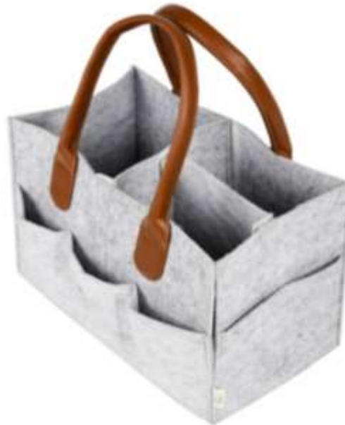
OFO 08 - W02