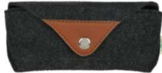
OEC 14 – B02

The felt sunglass cover is a fashionable and functional accessory for protecting sunglasses. Crafted from soft and durable felt fabric, it offers a secure and cushioned storage solution. With its sleek design and compact size, it easily fits into bags or pockets, ensuring sunglasses stay scratch-free and ready to wear in style.