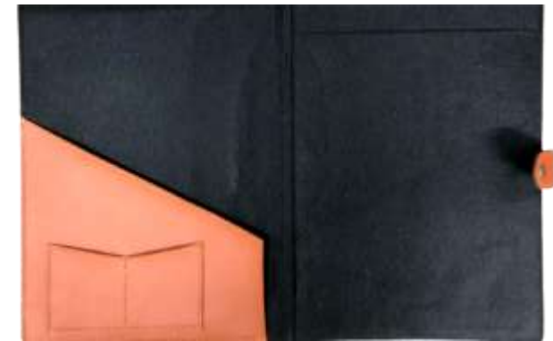
OCF 02 - B02

The felt conference folder is a professional and practical accessory for business meetings and events. Made from high-quality felt fabric, it features multiple pockets and compartments for organizing documents, business cards, and stationery. With its sleek design and secure closures, it adds a touch of sophistication while keeping essentials neatly organized for seamless conference experiences.