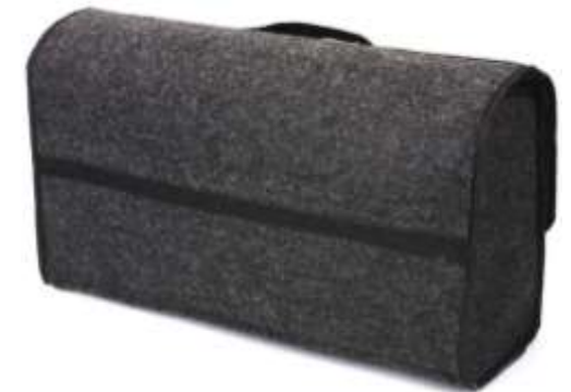
OCSO 04 - B