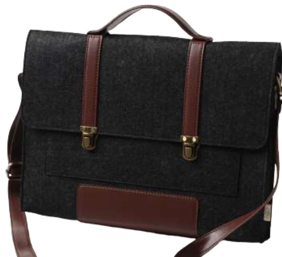
OLB 10 – B04