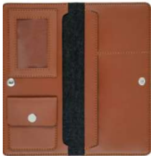
TRAVEL WALLET OFW 04