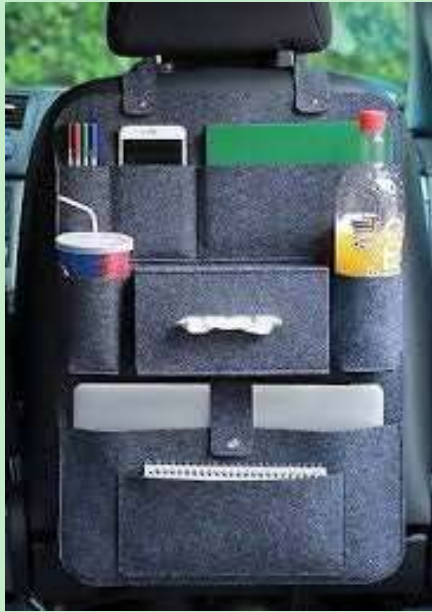
OCSO 01 - DG