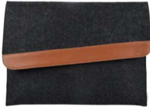
OLS 34 – B02