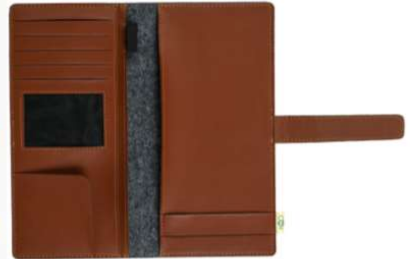
BANK ESSENTIAL WALLET OFW 05