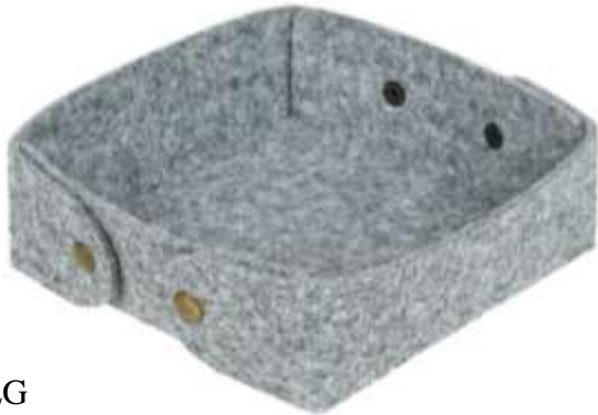
OSTB 16 – LG

The felt carry bags and hamper baskets are versatile essentials for office and home use. Made from durable felt fabric, they offer ample storage space and sturdy handles for convenient transportation.