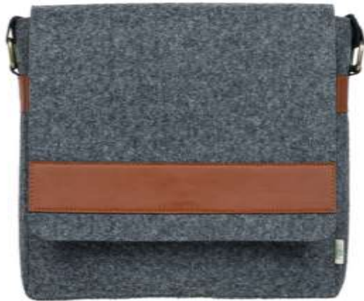
OSLB 08 – DGO2