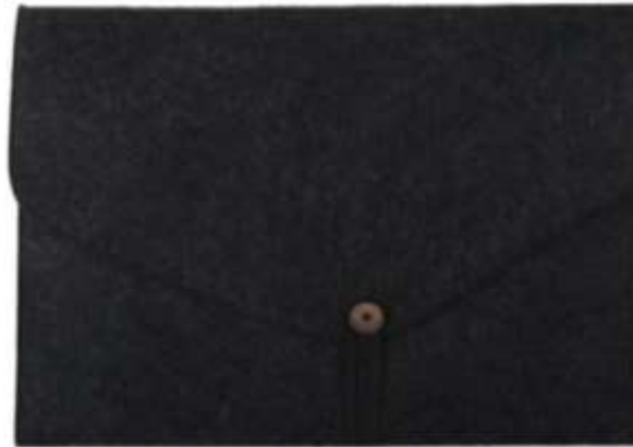
OLS 19 -B