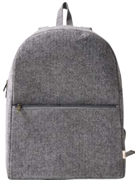
OBP 02 - LG

The felt backpack is a special gift for those seeking a unique blend of style and functionality. Crafted from high-quality felt fabric, it offers durability and a distinctive aesthetic appeal. With its spacious compartments, comfortable straps, and sleek design, it's perfect for carrying essentials in style, making it an ideal gift for any occasion.