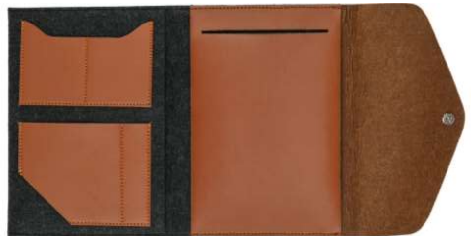
ODC 03 – B02