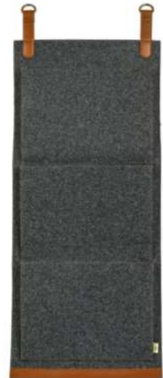
OFO 11 -DG02