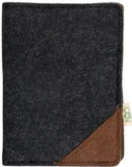
OPC 10 - Bbr

The felt passport cover is a stylish and practical accessory for travelers. Made from premium felt fabric, it offers a snug fit for passports, providing protection against wear and tear. With its sleek design and additional pockets, it allows for convenient storage of boarding passes, cards, and travel documents, making it a must-have item for globetrotters.