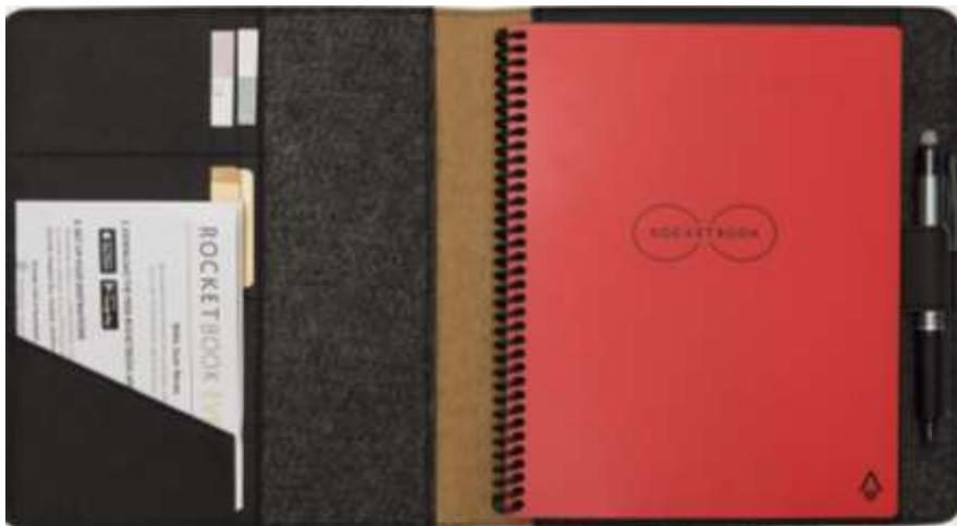
ODC 02 – Bbl