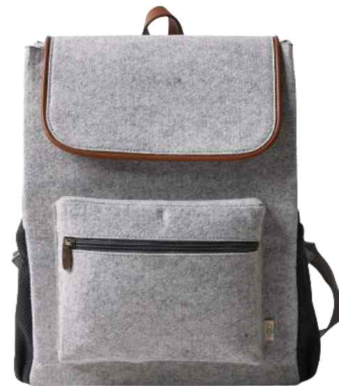
OBP 06 - W07