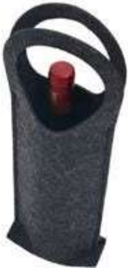
OBC 06 - B