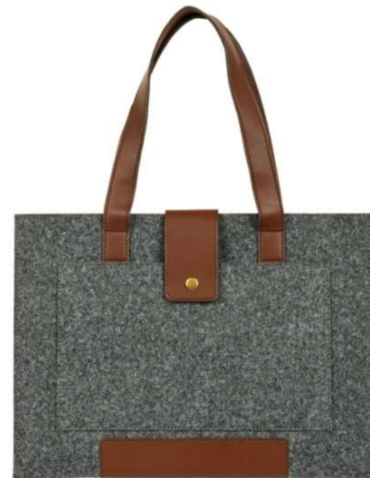
OLB 08 – DG04