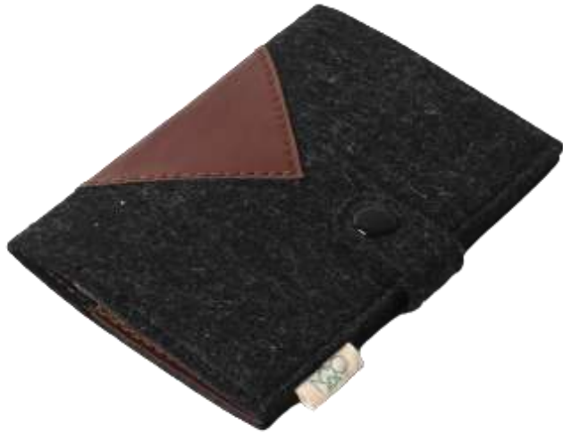
OPC 08 - W01