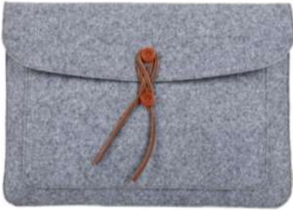
OLS 17 – LG06