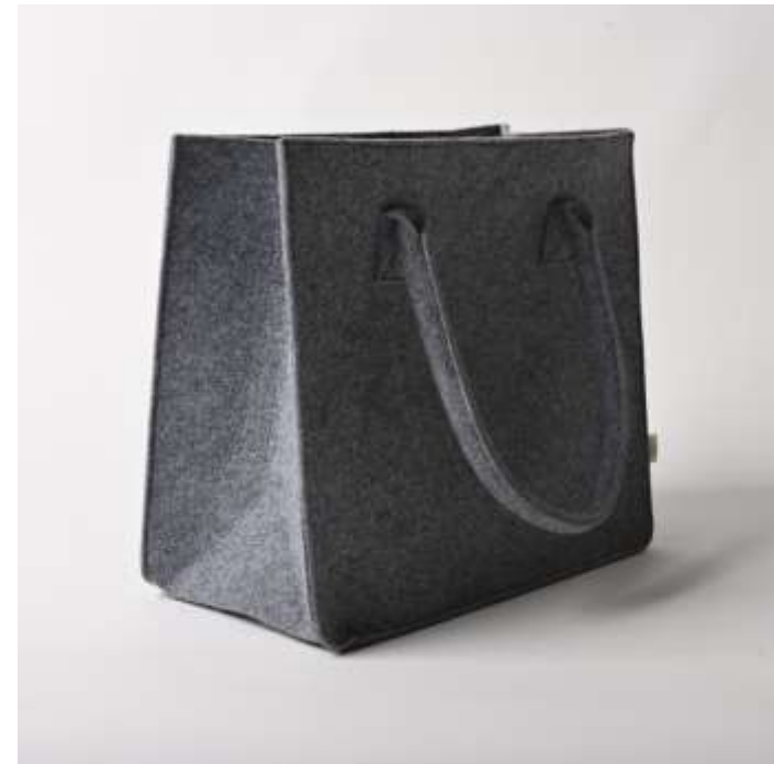
OSTB 10 - LG

Whether used for organizing office supplies or carrying useful documents or groceries, these bags and baskets combine functionality with a stylish design, adding a touch of sophistication to any setting.