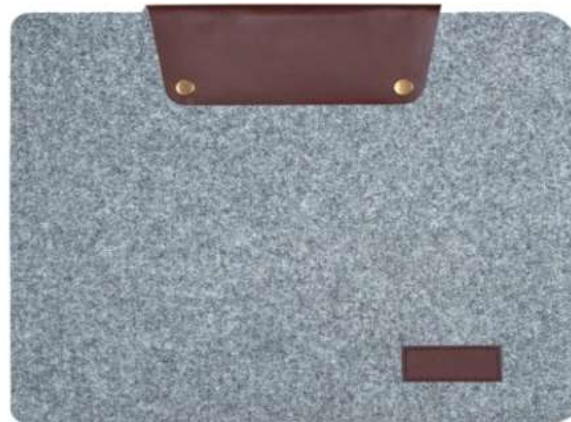
OLS 36 – LG04