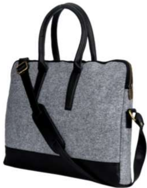
OLB 02 – LG01