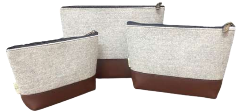
OFP 18 – W04