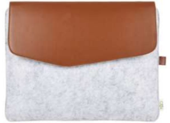
OLS 35 – W02