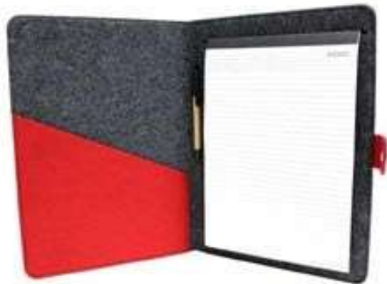
OCF 01 - DGrd