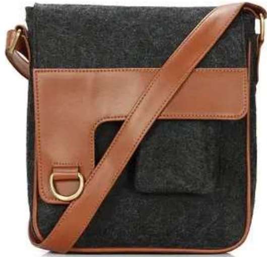
OSLB 04 – B07