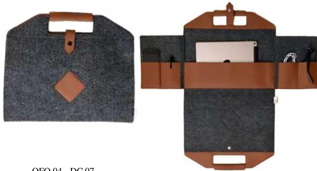
OFO 04 - DG 07