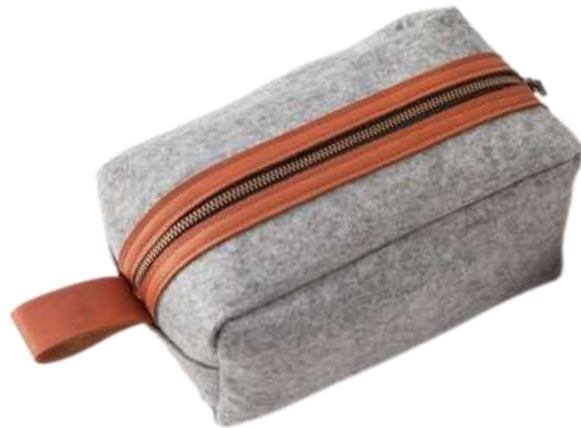
OFP 17 – LG02