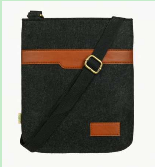
OSLB 07 – B02

The felt cross-body unisex slings are versatile and trendy accessories, ideal for gifting. Designed for both men and women, they offer a stylish way to carry essentials while keeping hands free. Made from durable felt fabric, these slings feature multiple compartments for organizing belongings, making them perfect for daily commutes or travel .