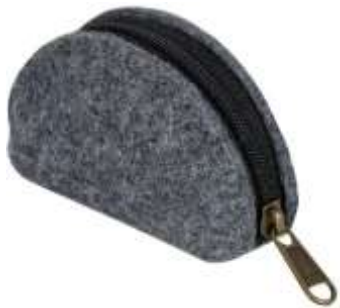
OFP 15 – DG02

The felt multipurpose pouches are basic accessory for organizing essentials. Crafted from durable felt fabric, it offers a convenient storage solution for various items such as cosmetics, gadgets, wires, travel essentials or stationery. With its impeccable design options and secure zipper closure, it is perfect for keeping belongings organized and protected on the go.