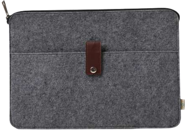
OLS 30 – LG06